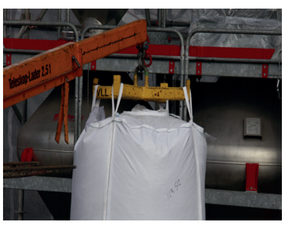
The material is transported from the big bag to the preloading container at the ground level with a forklift truck